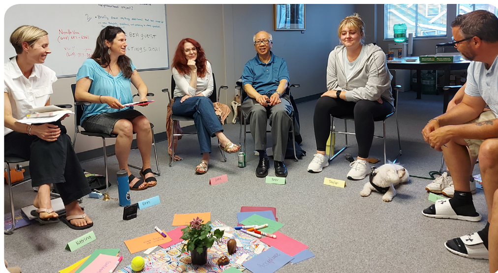
A typical Peace Circle, bringing parties together

Contact Nina Kreis at ninak@hscpc.com ■ Or see contact information at right.