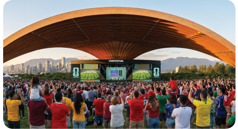
Fan's eye view of amphitheatre crowds

it, and in my opinion volunteering is the best way to contribute.”