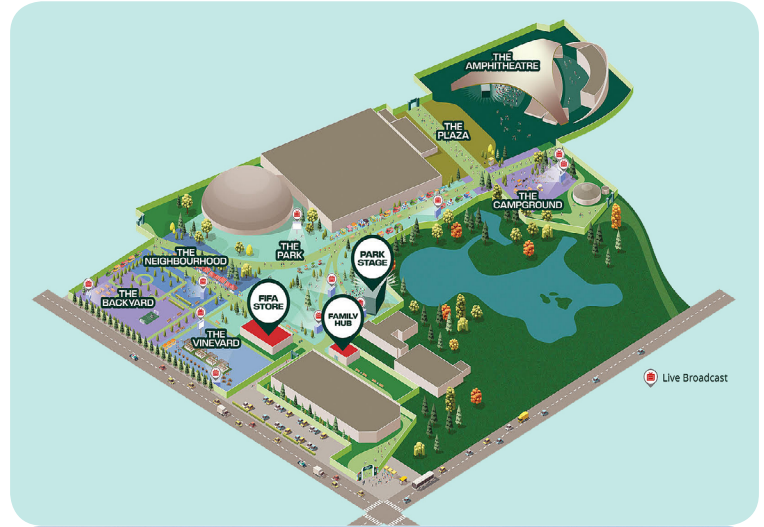
Bird's eye view of Fan Zone