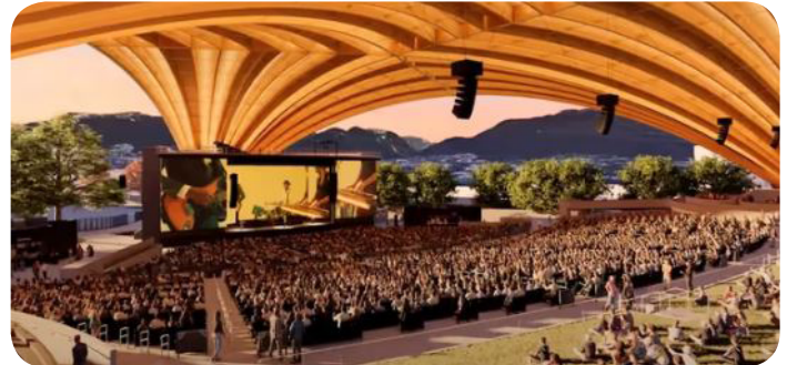
The new amphitheatre