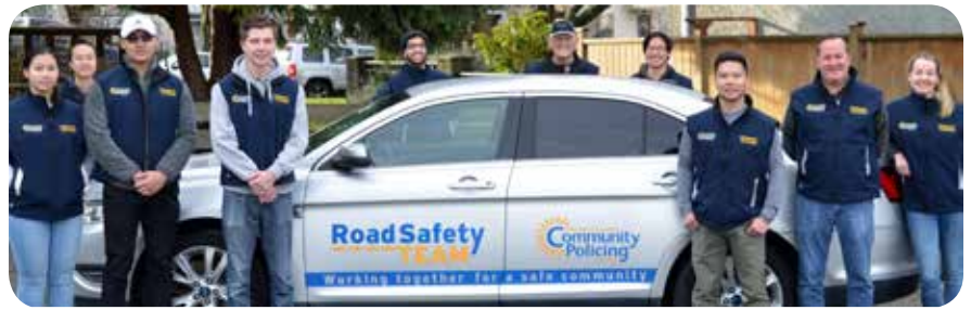
Volunteers in new vests with our new Road Safety car. Thanks to PCI Development Corp. for the vests and their support of the Road Safety Program

Thank you to all the sponsors and partners who have contributed to the Hastings Sunrise Community Policing Centre's many successes during 2018. You have all helped to make our community a safer and better place!